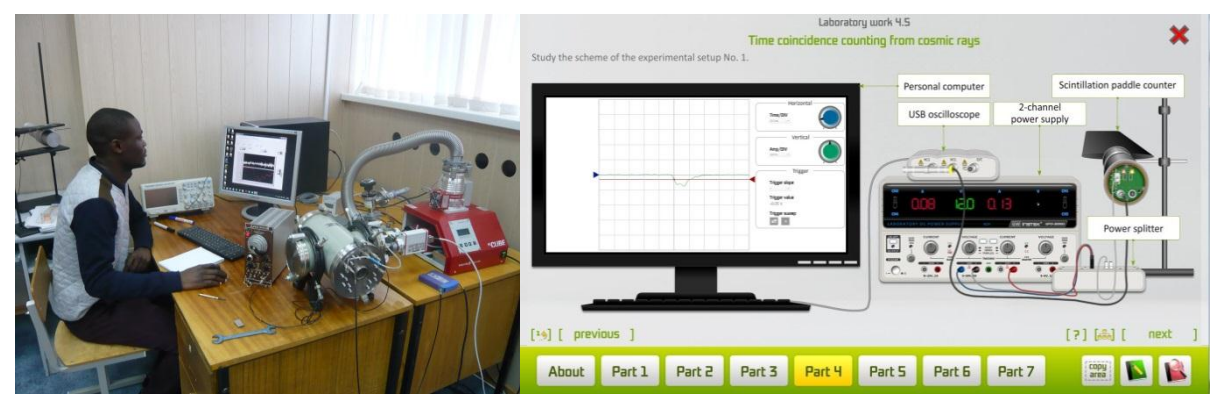
Fig. 3. Study of spontaneous nuclear fission using real and virtual equipment

The goal of the e-learning tool for students "Virtual Laboratory of Nuclear Physics" is to include current scientific data into the educational process, to conduct virtual and online laboratory research using modern scientific equipment and data obtained from the existing physical facilities. As the project result the web resource, that allows including modern nuclear physics practicum into educational process in the universities of Russia, JINR Member States and RSA, will be developed. At the previous project stage "Virtual Laboratory of Nuclear Fission" have been developed. In the framework of the present project it is planned to extend topics of laboratory practicum on researches connected with neutron physics and gamma spectroscopy. The perspective direction of the present project is the creation of the Interactive environment for nuclear experiment modeling.