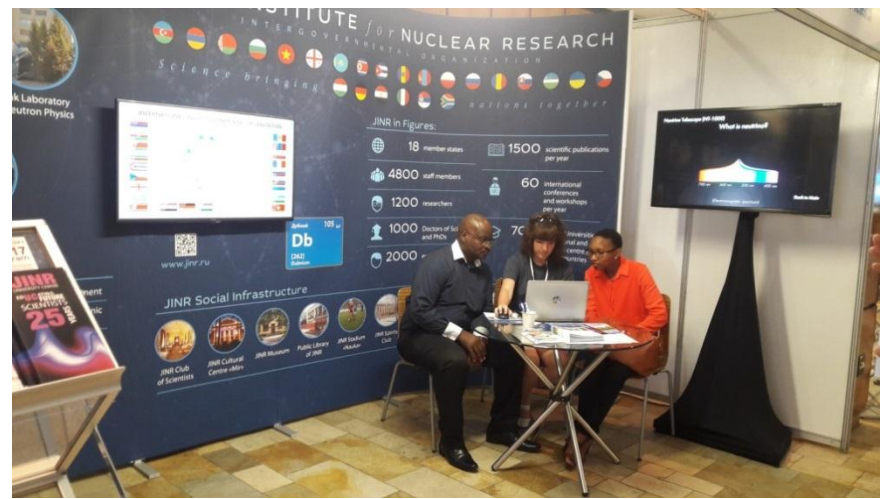
Fig. 2. JINR exposition at the Science Forum in RSA

Building brand awareness of JINR and NICA for a wider audience is one of the most important tasks. A good solution to this problem is creation of multimedia exhibits associated with the JINR research topics and participation in a variety of Russian and international exhibitions, days of science, museum exhibitions. In 2016 alone, the exhibits devoted to the 60<sup>th</sup> anniversary of JINR were presented in the Slovak Technical museum, at the Science Festival in Moscow, in the Kazan Federal University, in many JINR Member States, at the Science Forum in RSA. This activity is planned to be further developed within the project framework.