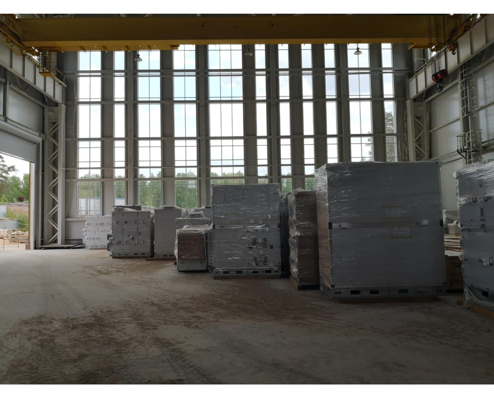
Now part of the SPD hall is used to store collider elements.