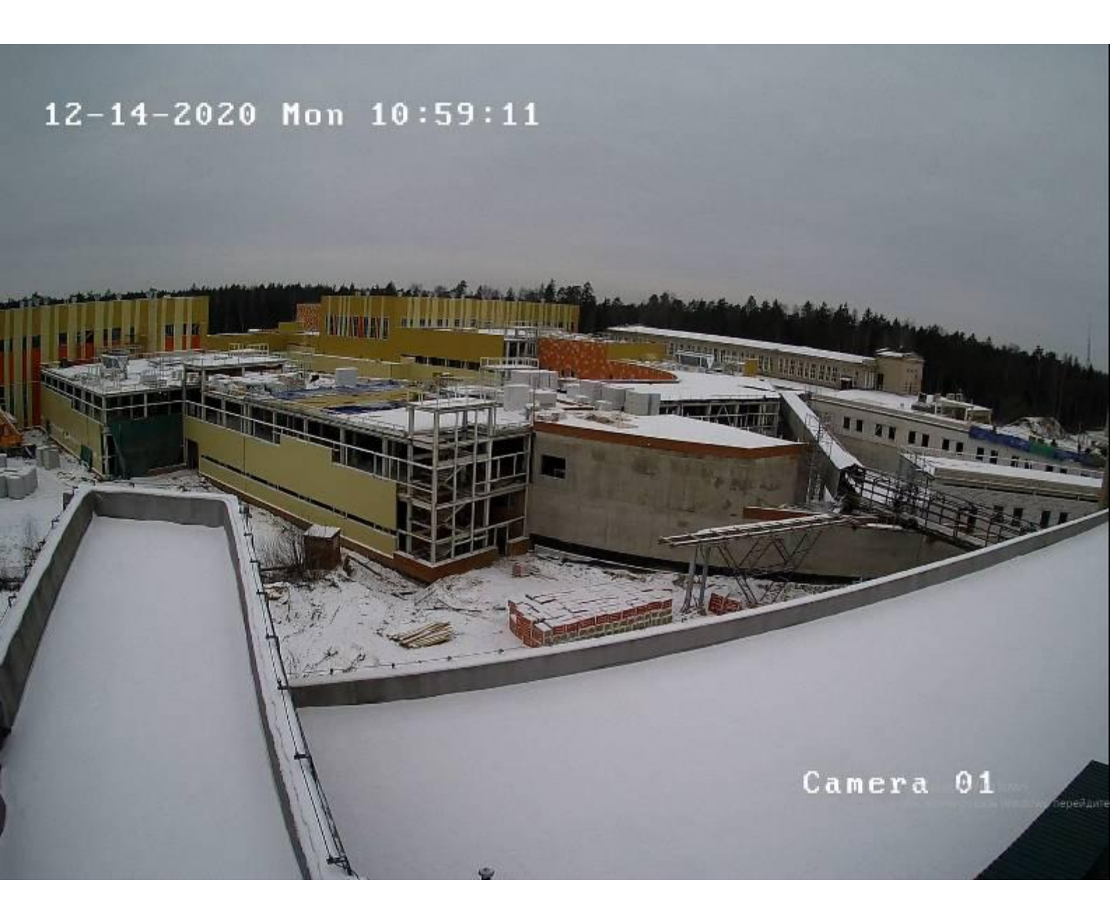
General view of the collider construction site in December last year.