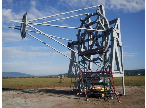
Fig.1. Left: the first TAIGA IACT, it takes data since 2016. Right: the second IACT was delivered from Dubna to Tunka in August 2018.

2b. Give a list of the responsibilities of JINR group members within the management structure of the collaboration, if any, giving the name of the JINR member, the managerial role and the appointment period.